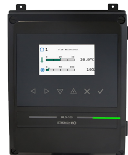
KLD-100 Room computer

One or two KLC-100s are required for your animal house. The KLC-100 measures and controls the central functions in your pig house such as: central air inlet, central exhaust, central heating and NH3. This unit has two integrated differential pressure sensors for the central duct and for a possible air scrubber.