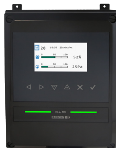
KLC-100 Animal house computer

The KL-6500 is placed in a central location, e.g. your office. Just touch the screen to see the current situation (e.g. via growth curves) in the various rooms and to intervene immediately in the event of any actual or imminent unsafe situations