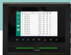
KL-6500 Management computer