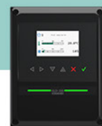
KLD-100 Room computer