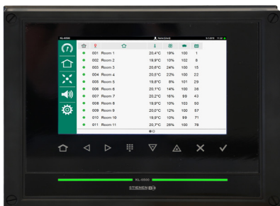
KL-6500 Management computer

The KLC-100, KLD-100 and KL-6500 together form the very strong trio that makes up Stienen's Mitch climate concept.