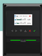
KLC-100 Animal house computer